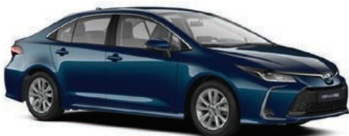
Midnight Teal (785)