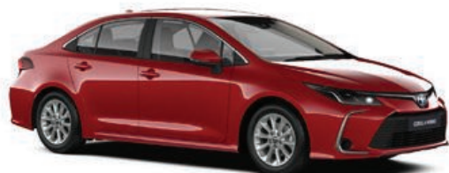
Pearl Red (3U5) Pearlescent