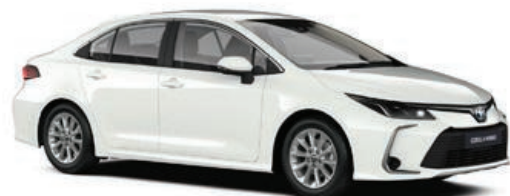
Pearl Ice White (089) Pearlescent