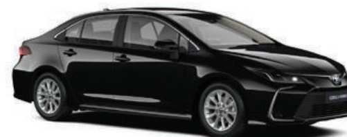
Night Sky Black (209)