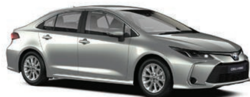
Atomic Silver (1L0)