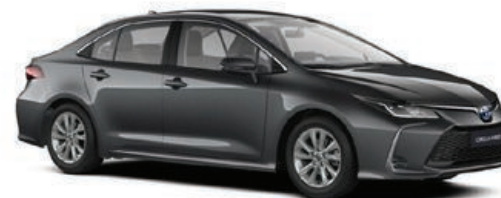
Ash Grey (1G3)