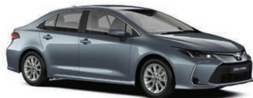
Celestite Grey (1K3)